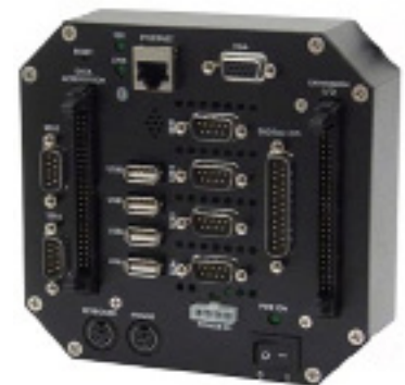
Octavio-HLV Embedded Application Server