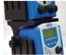
Production extension shelf