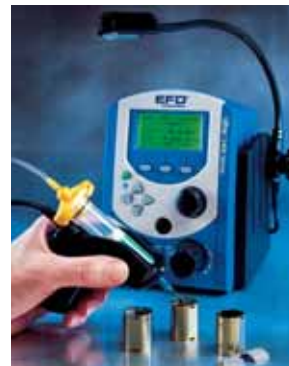
Model 2400 shown with workstation lamp and finger switch