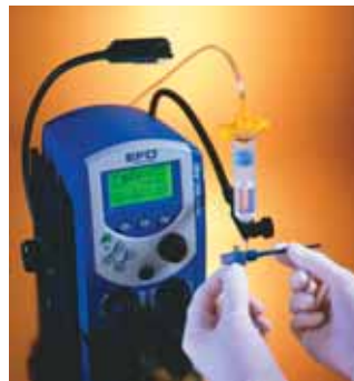
2400 dispenser with workstation lamp and flex arm barrel holder