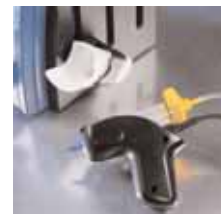
Hand grip with finger switch and built-in light