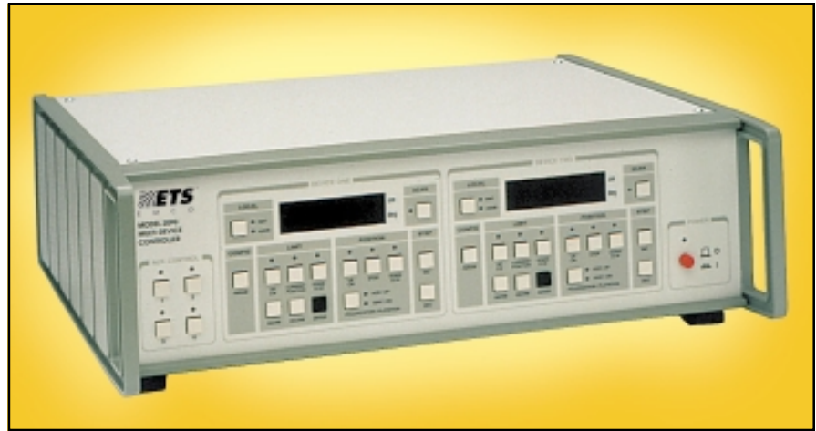
Model 2090 Positioning Controller

ETS-EMCO's Model 2090 Positioning Controller allows you to synchronize simultaneous movement of two primary ETS-EMCO devices (towers or turntables), and on/off operation of up to four auxiliary devices (LISNs, EUTs, etc.). Independent operation of primary devices can be performed manually, by either of the two front panel controls, or remotely, by a separate GPIB address for each device. Fiber optic control lines eliminate RF interference that can be conducted through traditional wire cables.