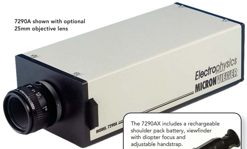
The 7290AX includes a rechargeable shoulder pack battery, viewfinder with diopter focus and adjustable handstrap.