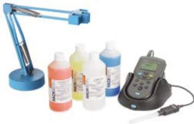
pH Starter Kit