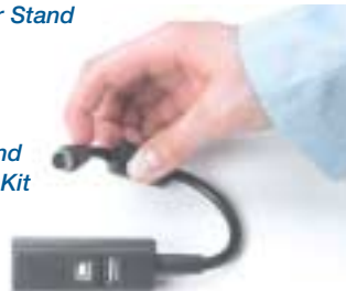
HQd Meter USB and AC Power Adapter Kit

Lit. No. 2599 Rev 3 F94 Printed in U.S.A.