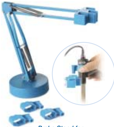
Probe Stand for Hach IntelliCAL Probes

iButton® is a trademark of Maxim Integrated Products.