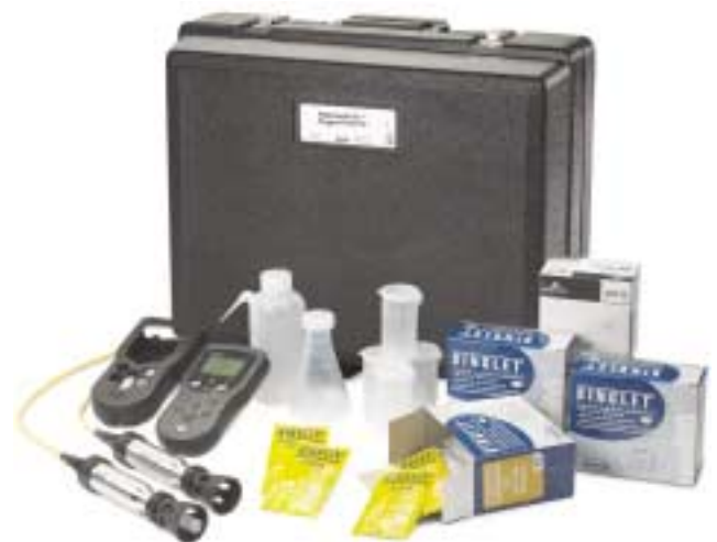
Rugged DO/pH Field Kit