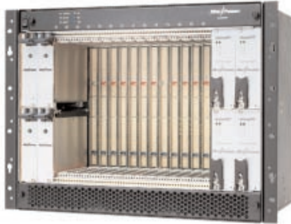
The C0814 is the first I-Bus enclosure to feature our fail-safe OptiCool™ design