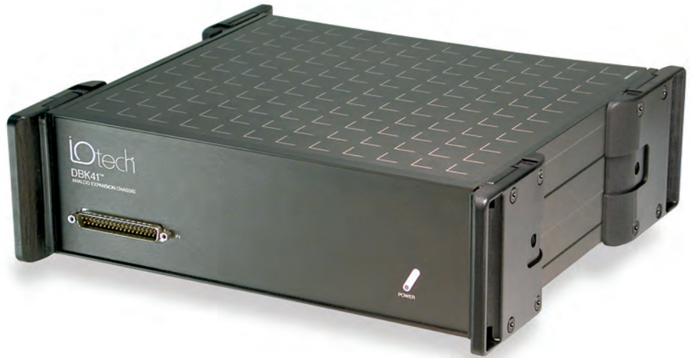
The DBK41 analog expansion module accommodates various analog signal conditioning and expansion cards in one system

The DBK32A can obtain its power from a number of sources: an included AC adapter, an optional DBK30A rechargeable battery/excitation module, DBK34 battery/UPS module, or any 9 to 20 VDC source, such as an automobile battery.