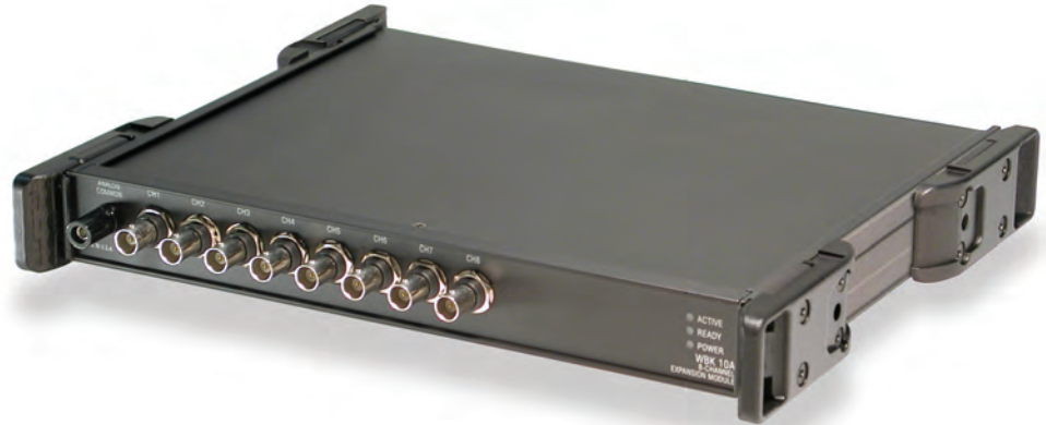
The WBK10A adds eight differential analog inputs to your WaveBook system

The WBK10A has a small form factor, letting you expand your system without expanding your space requirements