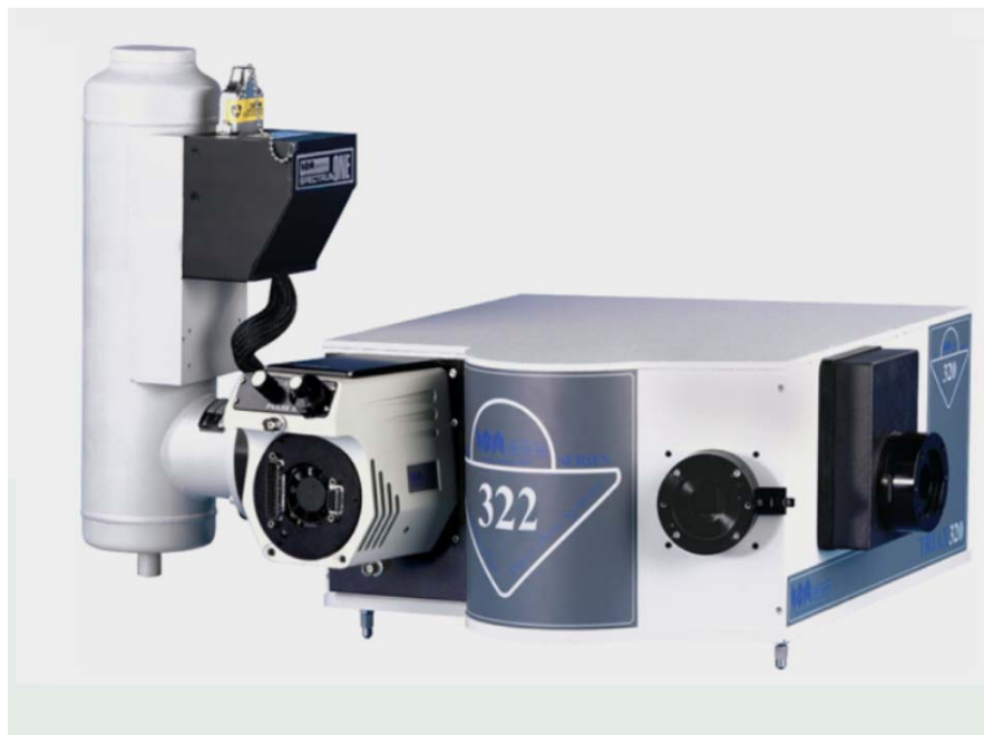
TRIAX322 dual array spectrograph equipped with two arrays detectors

A comprehensive range of accessories such as light sources, sample compartments, fibers, detectors, software can be supplied with our TRIAX.