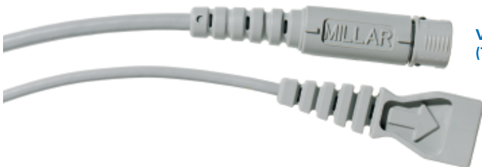
Viking Connector (TEC-10C)

Mikro-Tip Pressure Catheters are provided with either Viking (4-pin) or Millar Low Profile (4-pin) connectors depending on the model purchased. Catheter models with Viking connectors may connect directly to the TC-510. Connecting the catheter with a Viking connector directly to the control unit limits access to the subject or patient. It is recommended that a TEC-10C interface cable be used between the catheter and control unit. All catheters with low profile pressure connectors require a TEC-10D interface cable to the control unit. Each pressure channel requires a separate interface cable and control unit.