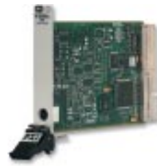
Figure 1. NI PXI-4021 Switch Controller