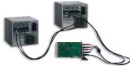
Figure 3. Add-On Chassis Kit (4-Slot)