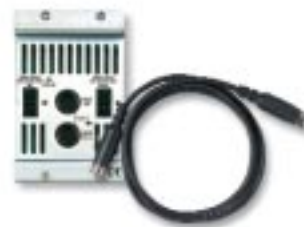
Figure 4. SCXI-1359 Adapter Kit