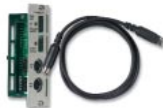
Figure 5. SCXI-1362 Adapter Kit