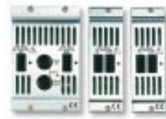
Figure 2. SCXI-1357 High-Voltage Backplane Assembly Kit