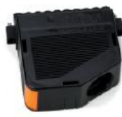
Figure 2. cRIO-9932 Strain Relief and High-Voltage Connector Kit