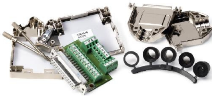
Figure 6. NI 9934 25-Pin D-Sub Connector Kit with Strain Relief and D-Sub Shell

The NI 9935 includes a screw-terminal connector with strain relief as well as a D-Sub solder-cup backshell for creating custom cable assemblies for any module with a 15-pin D-Sub connector.