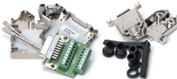
Figure 7. NI 9935 15-Pin D-Sub Connector Kit with Strain Relief and D-Sub Shell

The NI 9935 includes a screw-terminal connector with strain relief as well as a D-Sub solder-cup backshell for creating custom cable assemblies for any module with a 15-pin D-Sub connector.