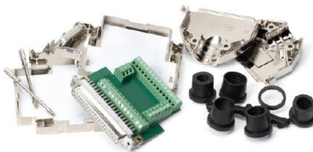
Figure 5. NI 9933 37-Pin D-Sub Connector Kit with Strain Relief and D-Sub Shell

The NI 9933 includes a screw-terminal connector with strain relief as well as a D-Sub solder-cup backshell for creating custom cable assemblies for any module with a 37-pin D-Sub connector.