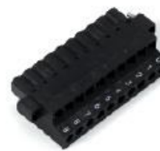
Figure 3. cRIO-9936 10-Position Screw- Terminal Plugs

The table below lists the recommended connector block accessories for each CompactRIO analog output module.