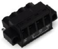
Figure 1. cRIO-9937 Power Supply Plugs