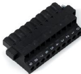
Figure 8. NI 9936 10-Position Screw-Terminal Plugs

The NI 9936 consists of 10-position screw-terminal plugs for any 10-position screw-terminal module.