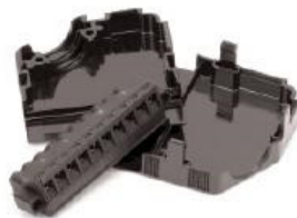
Figure 4. NI 9932 10-Position Strain Relief and High-Voltage Screw-Terminal Connector Kit

The NI 9932 kit provides strain relief and operator protection from high-voltage signals for any 10-position screw-terminal module.