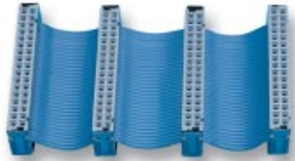
Figure 7. RTSI Bus Cable