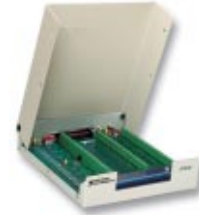
Figure 3. SCB-68 Shielded I/O Connector Block

SCB-68 .....776844-01 Dimensions – 19.5 by 15.2 by 4.5 cm (7.7 by 6.0 by 1.8 in)