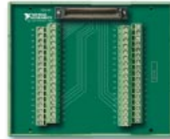
Figure 5. TBX-68 I/O Connector Block

TBX-68 .....777141-01 Dimensions – 12.50 by 10.74 cm (4.92 by 4.23 in.)