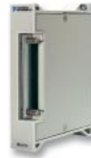
Figure 4. TB-2715 I/O Terminal Block

TB-2715 .....778242-01 Dimensions – 8.43 by 10.41 by 2.03 cm (3.32 by 4.1 by 0.8 in.)