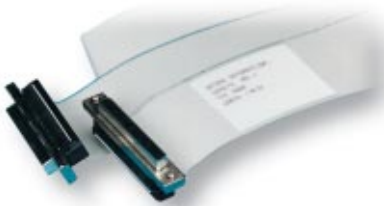
Figure 10. R6868 Ribbon I/O Cable