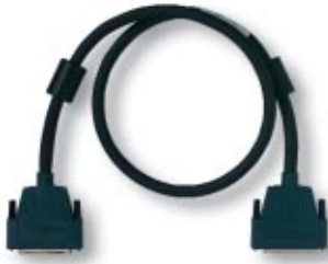
Figure 9. SH68-68-D1 Shielded Cable