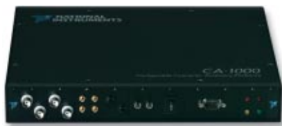
Figure 2. CA-1000 Configurable Signal Conditioning Solution