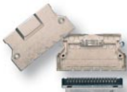
Figure 11. 68-Pin Custom Cable Kit