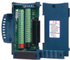
Figure 1. cFP-CB-1 General-Purpose Connector Block with Strain Relief

The most secure and compact connectivity option is to use the Compact FieldPoint integrated connector blocks – the cFP-CB-1, cFP-CB-2, cFP-CB-3, cFP-CB-4, and cFP-CB-11.