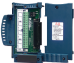
Figure 3. cFP-CB-3 Isothermal Connector Block for Thermocouple Measurements

The cFP-CB-2, suitable for any I/O module, is a general-purpose connector block with front accessibility. With 36 terminals, the connector block simplifies wiring by eliminating the need to connect more than one wire to a terminal. The cFP-CB-2 also features a removable spring-terminal connector that allows easy front-panel access to the terminals for wiring. If your application is subject to hazardous voltage and/or high vibration, install the NI 9940 backshell on the spring-terminal connector.