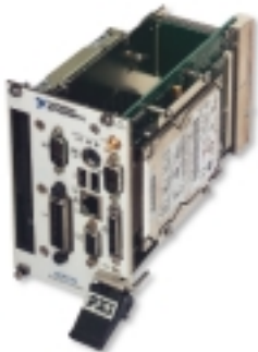
Figure 2. The NI 8176 integrates a 1.26 GHz Intel Pentium III processor and GPIB (IEEE 488) interface.

connecting to external CD-ROMs (see Figure 3), speakers, and printers. Video connections are made through a standard 15-pin D-Sub connector. Use the IEEE 1284 ECP/EPP parallel port to connect to a wide variety of high-performance devices, including tape backup drives, printers, and scanners. An RS-232 port is available for connecting to serial devices.