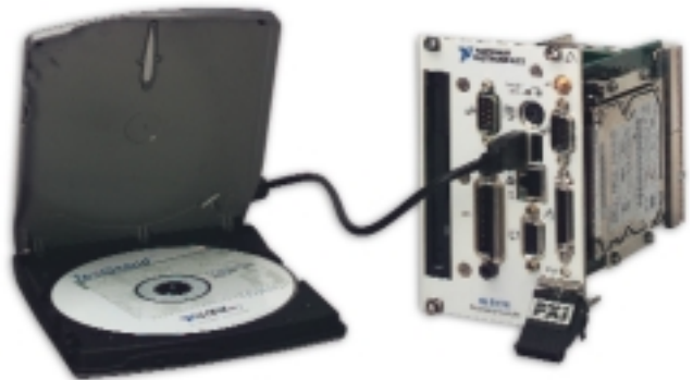
Figure 3. USB CD-ROM

National Instruments offers an external USB CD-ROM for use with your NI 8171 Series embedded controllers (see Figure 3). Using the USB interface, connect this CD-ROM to your embedded controller for easy software installation and upgrades. The CD-ROM is completely powered through the USB port, so no external power connections are required.