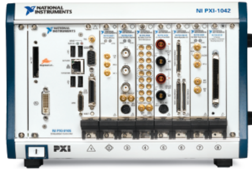
Figure 2. This PXI-8105 controls an 8-slot PXI modular instrumentation system.

The PXI-8105 includes an ExpressCard/34 slot. ExpressCard uses the PCI Express and Hi-Speed USB serial interfaces to provide up to 2.5 Gb/s of bidirectional throughput. Use the ExpressCard/34 slot to add a second gigabit Ethernet port to your system or additional peripheral I/O such as external SATA hard drives, 802.11 wireless LAN, IEEE 1394, Bluetooth, or various memory adapters.