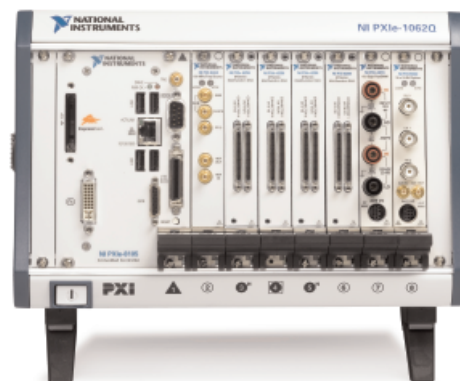
Figure 1. This NI PXIe-8105 controls an 8-slot PXI Express modular instrumentation and data acquisition system.

The NI PXIe-8105 includes the dual-core Intel Core Duo processor T2500. Dual-core processors contain two cores, or computing engines, in one physical processor. This enables dual-core processors to simultaneously execute two computing tasks, which is advantageous in multitasking environments, such as Windows XP, where multiple applications run simultaneously. Two applications, such as NI LabVIEW and Microsoft Excel, each execute on a separate core at the same time. This improves overall system performance. Multithreaded applications, such as LabVIEW, take full advantage of dual-core processors because they separate their tasks into independent threads. A dual-core processor can simultaneously execute two of these threads.