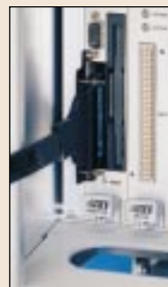
VXIpc-700 Series with PCMCIA Strain-Relief Kit

* The VXIpc-700 Series VXI Development and Run-Time Systems do not include VxWorks installed on the hard drive. Please contact Wind River Systems at (800) 545-Wind.