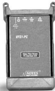
INTERFACE UNIT VFS1-PC and VFS1-PCE