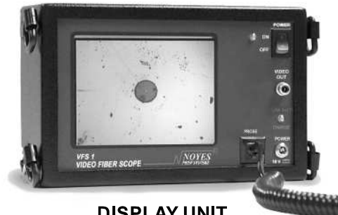
DISPLAY UNIT VFS1 and VFS1-CE