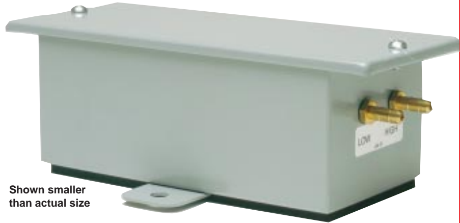
Shown smaller than actual size