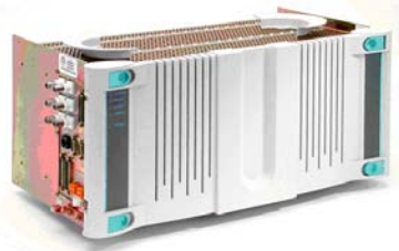
OSIRIS™ XTS Shelf

The OSIRIS XTS Shelf is an 18".-wide shelf that is mountable in a 23". rack, on a wall, or in a cabinet. Alarm and craft interfaces, as well as power and traffic-carrying signals, are located on both the left and right sides of the shelf to provide convenient access. The OSIRIS XTS Shelf is ideal for 622M or 2.5G rings with medium-fill SONET/SDH access applications. Some of the features the XTS shelf provides are: