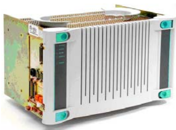
OSIRIS™ STD Shelf

The OSIRIS STD Shelf is a 14".-wide shelf that is mountable in a 19". rack, in a 23". rack, on a wall, or in a cabinet. Alarm and craft interfaces, as well as power and traffic-carrying signals, are located on both the left and right sides of the shelf to provide convenient access. The OSIRIS STD Shelf is an ideal product for medium-to-low-fill SONET/SDH access applications, including corporate center and campus systems. The STD shelf provides the following features: