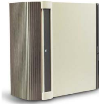
OSIRIS™ Micro WMU

The OSIRIS Micro WMU combines an OSIRIS Micro Shelf and a power supply. Both elements are enclosed in a wall-mountable cabinet specifically designed for customer premise applications. It is ideal for very-low-fill SONET/SDH applications, including small offices, schools, utilities and cellular sites where access to the equipment is not restricted. The OSIRIS Micro WMU is available in DS1/E1 and DS3/E3 configurations. Alarms LEDs are located on the side of the cabinet for convenient maintenance.