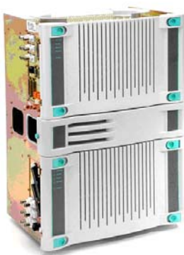
OSIRIS™ XTD Shelf

The OSIRIS platform enables you to tailor your solution with respect to line rate and bandwidth usage/segmentation. The first element of the system is the shelf. The OSIRIS platform offers five application optimized shelf models: XTD, XTS, STD, Micro and Micro Wallmount Unit (WMU). All shelves are convection-cooled and equipped with an emergency power feed input.