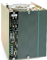
OSIRIS™ Micro Shelf

The OSIRIS Micro Shelf is a highly compact shelf specifically designed for low-density cabinet and customer premise applications. It is ideal for very low fill applications, including small offices, schools, utilities, and cell sites. The OSIRIS Micro Shelf is available in DS1/E1 and DS3/E3 configurations. Alarm and craft interfaces, as well as power and traffic-carrying signals, are located on the front of the shelf to provide convenient access. The Micro Shelf features: