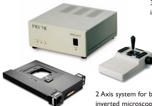
2 Axis system for both upright and inverted microscopes