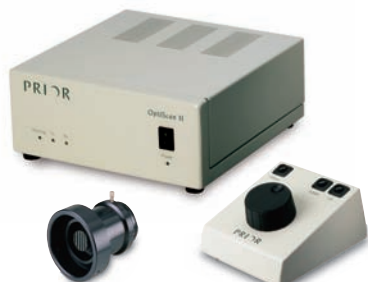
1 Axis system

Applications involving microscope automation are many and varied. OptiScan™II was designed with this in mind and the result is the most flexible system commercially available. OptiScan™II components can be configured in many different ways meaning that systems can be tailored to match your exact requirements. If your needs change you can rest assured that OptiScan™II offers a simple path to future upgrades.