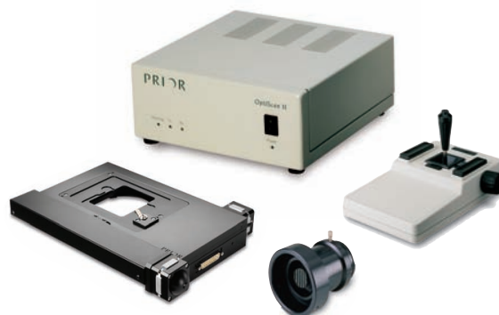
3 Axis system for both upright and inverted microscopes