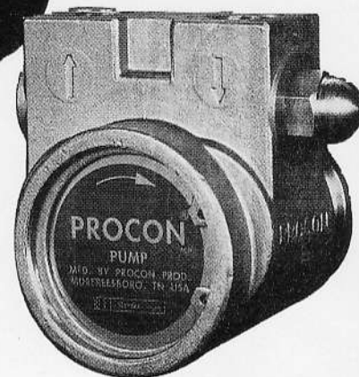
Series 5 Stainless Steel