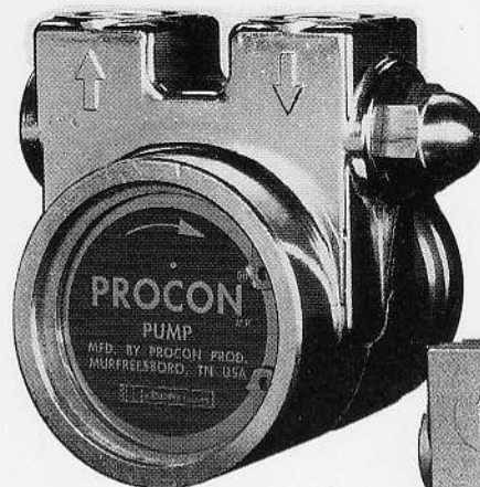
Series 4 Brass