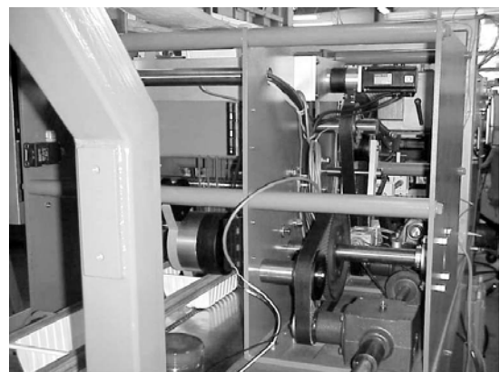
Fig.2 Lug Chain Conveyor

Trays are placed one-by-one into a servo-driven Lug Chain Conveyor from a stack of trays at the de-nesting station. Fig.2 shows the entry of trays on the Lug Chain Conveyor.