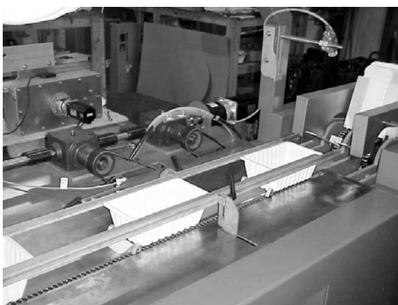
Fig.4 Tray Re-Nester

At the end of the Lug Chain, the trays are stacked using a mechanical re-nester. Fig.4 shows the Tray Re-Nester.