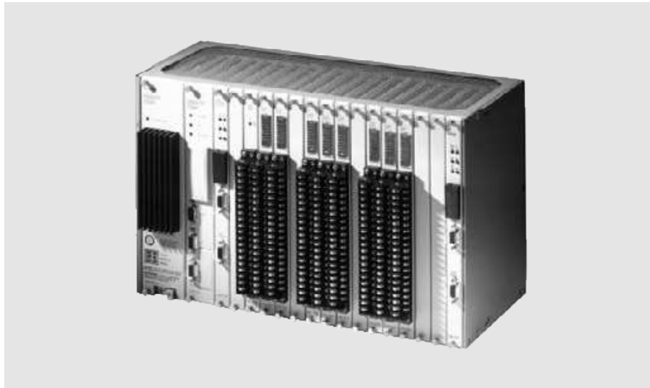
Fig. 5/1 SIMATIC 505 programmable controllers

The SIMATIC 505 programmable controllers provide a special combination of open-loop control tasks, closed-