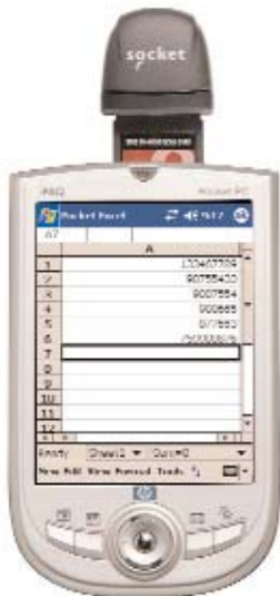
SD Scan Card and HP iPAQ h1930 Pocket PC