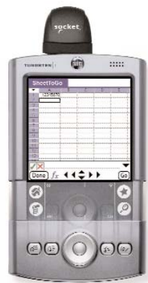
SDSC 3E and Palm Tungsten