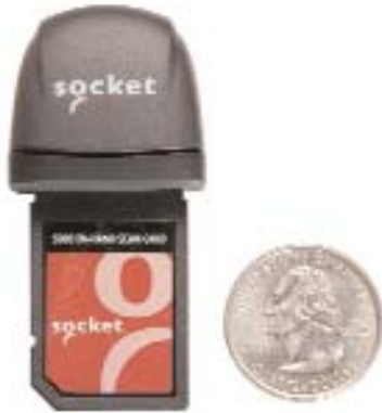
SD Scan Card 3E Product# IS5300-464

SDIO Card with Integrated Bar Code Scanner for Palm and Pocket PC 2003