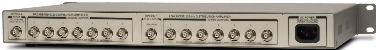
FS735/1/4 Rear Panel with one Broadband 50Ω distribution amplifier and one 10 MHz distribution amplifier side by side.