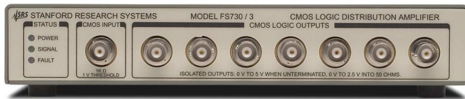
FS730/3 Front Panel

FS730 and FS735 series — CMOS Logic Distribution Amplifier