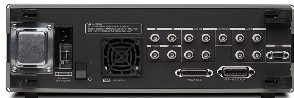
SR810/830 rear panel