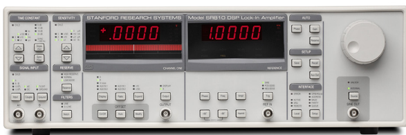
SR810 DSP Single Phase Lock-In Amplifier