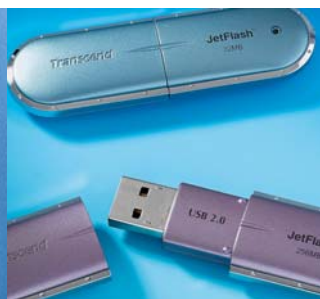
USB stick for data storage.