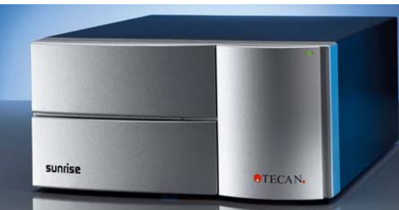
Sunrise Remote Control.