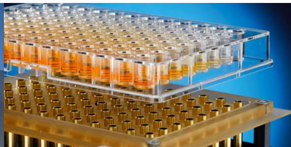
Temperature control option.