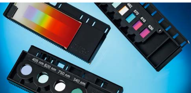
4 filter, 6 filter or free wavelength selection filter.

The versatile Sunrise microplate absorbance reader, gives you all the features you need for many different applications for diagnostic, pharmaceutical as well as for research laboratories. The NEW generation Sunrise Touchscreen Color adds a new dimension to user-friendliness and computer-independent data processing.