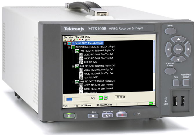
MTX100B MPEG-2 Recorder and Player