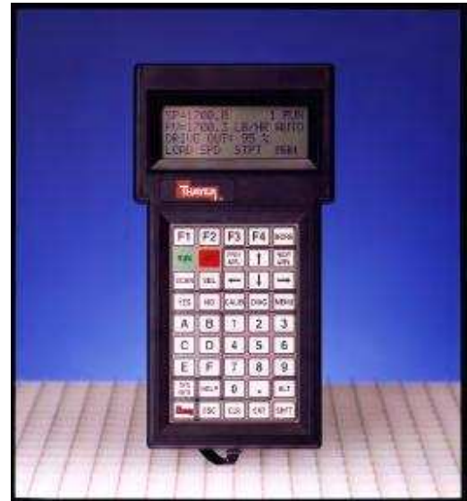
Tool for Setup, Initial calibration and Diagnostics