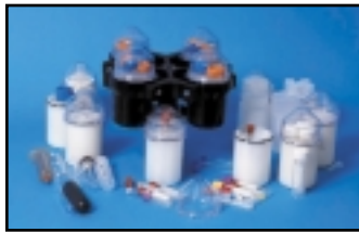
6555C Swinging Bucket Rotor