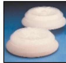
7851C & 7848C Fixed Angle Rotors