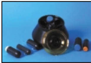
7685C Fixed Angle Rotor