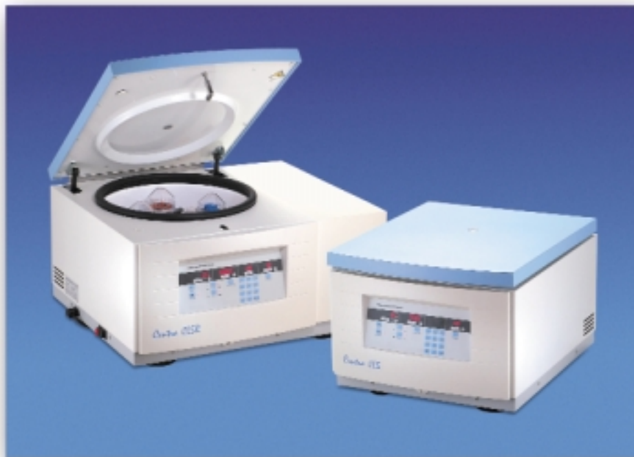
Centra-CL5R (refrigerated) and Centra-CL5 (ventilated)

The Centra-CL5 and Centra-CL5R multi-purpose centrifuges offer both high-speed and high-volume versatility along with a large assortment of rotor options, making them ideal for a wide variety of laboratory applications.