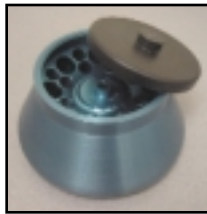
7828C Fixed Angle Rotor