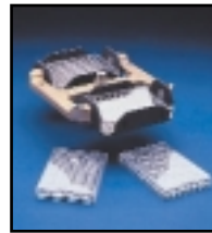
6244C Microplate Rotor