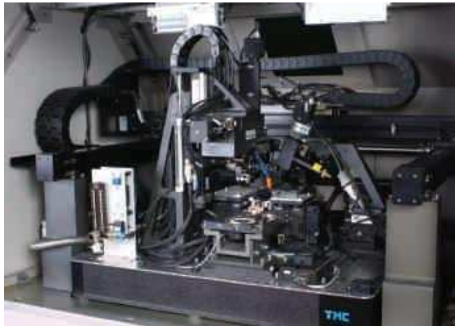
Automation Engineering Incorporated designed and produced this high-end alignment and laser welding station for complex opto-electronics. The station uses TMC's 63-500 Series vibration isolation system, which incorporates Gimbal Piston™ air vibration isolators to filter both vertical and horizontal floor vibration. The vibration isolation system also includes a CleanTop® Steel Honeycomb Optical Top to provide an extremely stiff, damped structure with a flat, stainless steel working surface and an array of drilled and tapped mounting holes. This table is the foundation for AEI's station, a combination of precision motion stages, machine vision, flexible and re-configurable control software, and interchangeable tooling to reliably and repeatably align and weld multiple photonic components.

CleanTop® features TMC's patented spill-proof, drilled and tapped mounting hole array. Tops are 4 in. (100 mm) thick and have 1/4–20 holes on 1 in. spacing or M6 holes on 25 mm spacing. The small cell-size steel honeycomb design provides even stiffer and better damping than our stainless steel laminate. Guaranteed flat to \pm 0.005 in. ( \pm 0.13 mm).