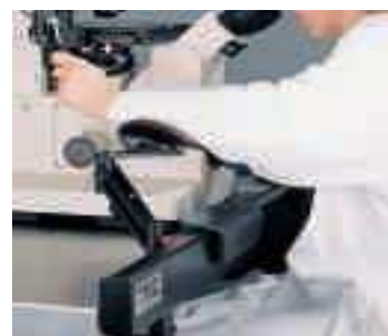
Articulated Armrests ease microscope use.

Our rugged, leather Articulated ArmRest adds stability and comfort when delicate manipulations must be made without disturbing the isolated surface. Mounts to front support bar or perimeter enclosure.