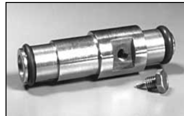
Injector module with Bolt-type Calibrated