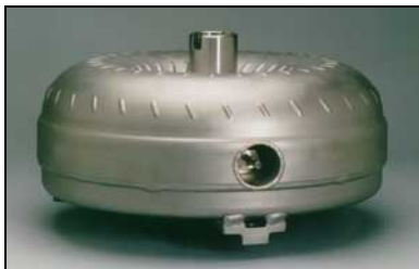
Torque Converter with built-in Calibrated Leak

As the builder of high-reliability Leak Testing Systems for manufacturing plants, VTI knows the importance of the 100% assurance of testing validity that can only be achieved by using these "Calibrated Test Parts". We have built these A2LA-accredited, custom leak standards into test parts of many different products such as those listed.