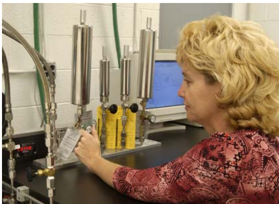
One of VTI's Calibration Systems

Repair services including replacement parts and refilling or rebuilding services to restore or adjust leak rates are performed for all manufacturers' leaks.