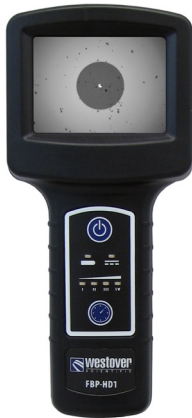
HD1 Handheld Display with 3.5-in LCD