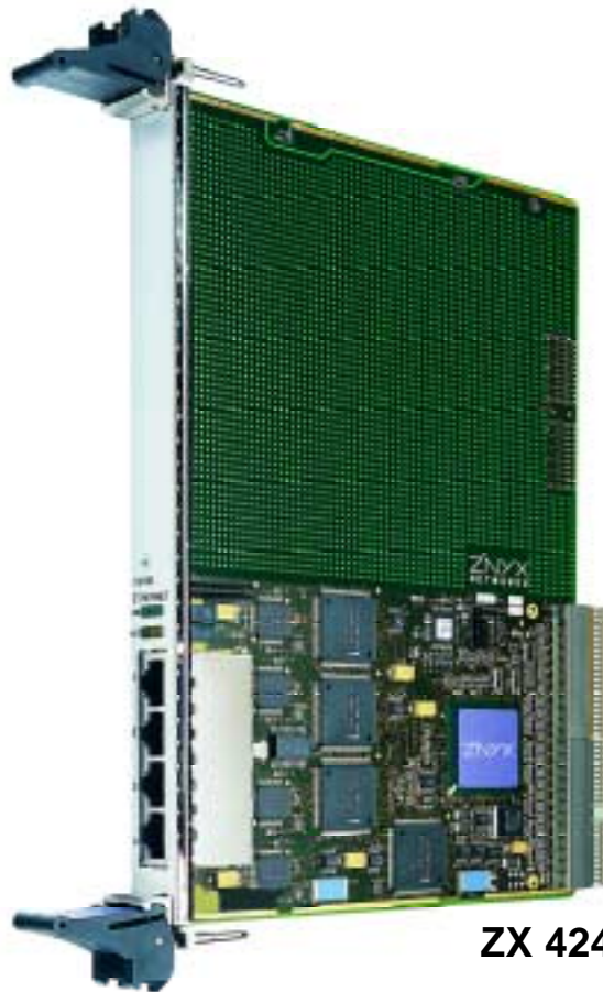
ZX 424 6U (pictured)