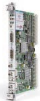
ZMI 2002 Dual Axis 6U VME

Covered by one or more of the following US Patents: 4,688,940 4,684,828 4,693,605 4,717,250 4,752,133 4,746,216 4,787,747 4,807,997 4,881,815 5,767,972