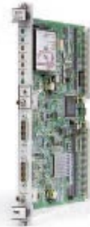
ZMI 2001 Single Axis 6U VME