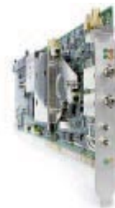
ZMI PC Single Axis ISA Bus